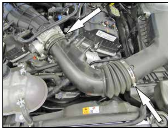
3. Loosen the hose clamps and then remove the factory intake tube.