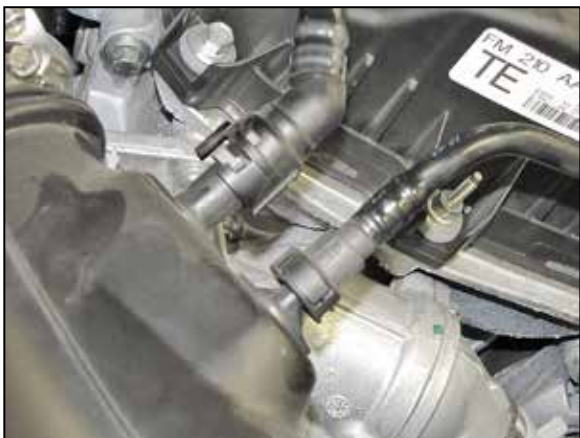
2. Disconnect the crank case vent line and EVAP vent lines from the Intake tube.

1. Turn off the ignition and disconnect the negative battery cable. NOTE: Disconnecting the negative battery cable erases pre-programmed electronic memories. Write down all memory settings before disconnecting the negative battery cable. Some radios will require an anti-theft code to be entered after the battery is reconnected. The anti-theft code is typically supplied with your owner's manual. In the event your vehicles anti-theft code cannot be recovered, contact an authorized dealership to obtain your vehicles anti-theft code.