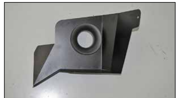
6. Install the filter adapter into the heat shield as shown using the provided hardware.