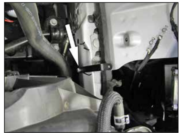
5. Install the heat shield mounting bracket (064325) onto the inner frame rail with the provided hardware as shown.