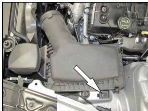
4. Remove the bolt securing the factory air filter housing and then remove the complete air filter housing from the vehicle. NOTE: K&N Engineering, Inc., recommends that customers do not discard factory air intake.